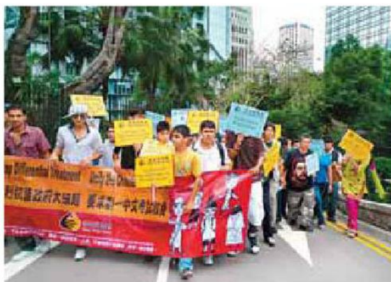
■ 近百名少數族裔學生、家長及相關人士抗議考試費昂貴，要求政府提供更多資助。

【本報訊】(記者 覃卓嘉)教育局去年起容許非華語學生以英國會考GCSE中文科成績，等同香港會考中文科成績，以符合報考高考及報讀大學的基本要求。有團體昨日發動近百名少數族裔學生及家長遊行至政府總部，抗議中文考試費用為少數族裔家庭帶來沉重經濟負擔，他們指現時中文科考試費僅195元，但GCSE中文科費用卻貴4倍達965元，要求政府提供更多資助，讓兩者看齊。