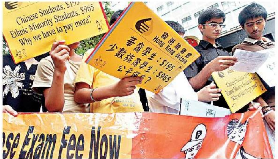
逾 100 名少數族裔學生昨到政府總部請願，不滿考試費高昂加重學生負擔。