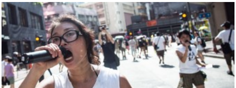
One year after Occupy, what's the best way forward for HK?