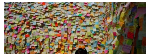
Groups plan silent rally to mark protest anniversary