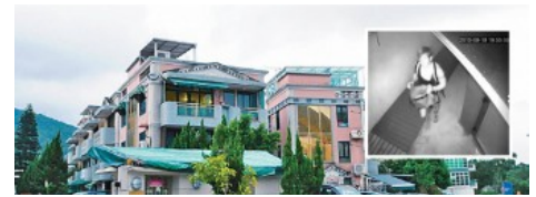
Burglar walks away with HK$320,000 from Sai Kung village house