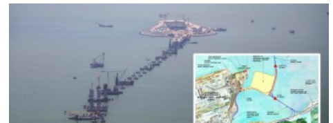
Island drift threatens further delays in cross-border bridge