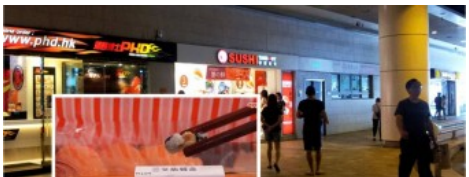
Woman finds three false teeth in take-out sushi