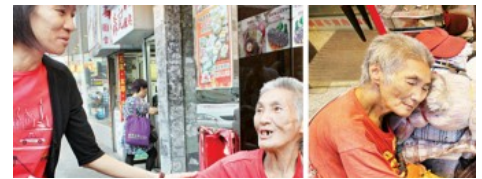
Neighbors comfort old newspaper vendor who lost money to thieves