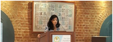
Ethnic minorities marginalized by language barrier: study