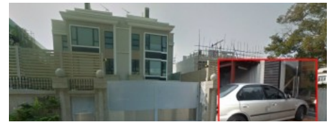
Shoe magnate's house in Kowloon Tong attacked by car-riding men