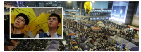
HKFS vows organizational reform to regain trust of students