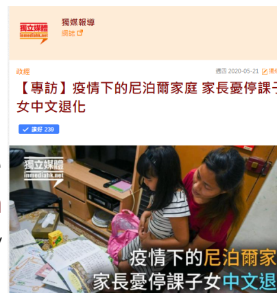
Mainstream media report