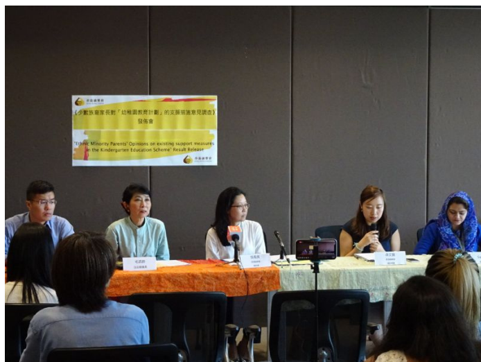
Policy change through research findings