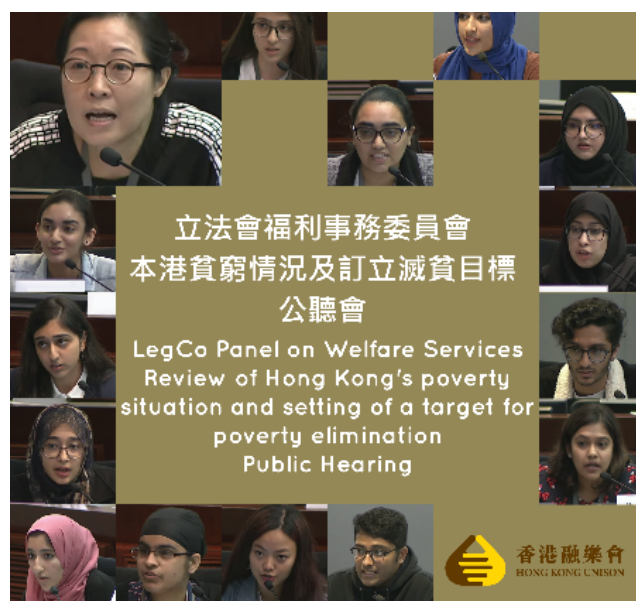
Public hearings and submissions