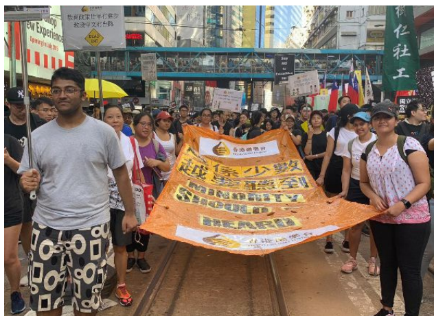
July 1st Rally