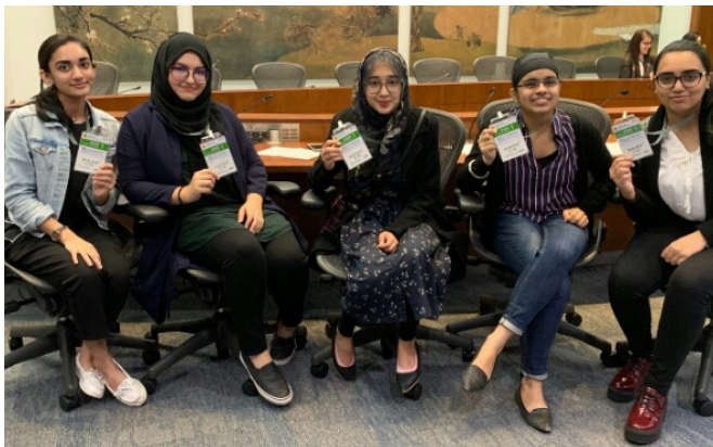
Scholarship awardees at a public hearing