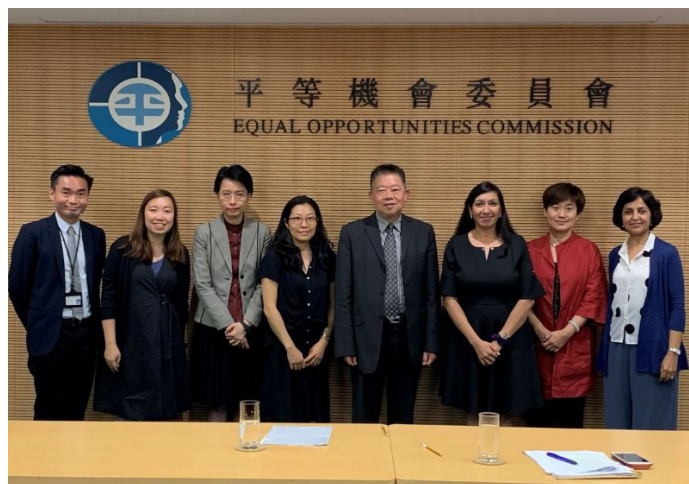
Meetings with duty bearers