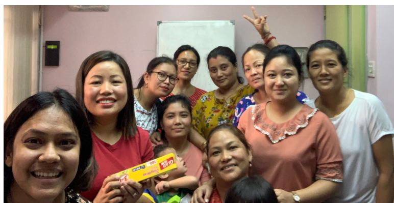
Focus group discussion and submission to Task Force on Review of School Curriculum