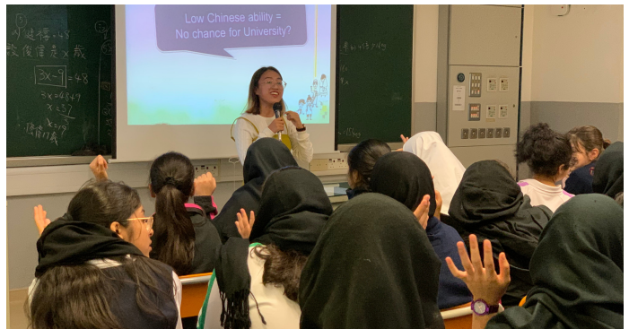
Scholarship awardee giving a career guidance sharing in a secondary school