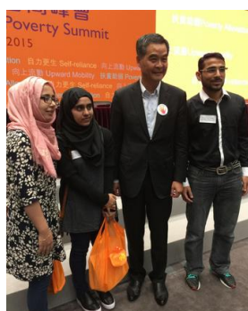
Youths meeting with the Chief Executive at Commission of Poverty Summit