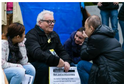
Human Library at IN.VISIBLE